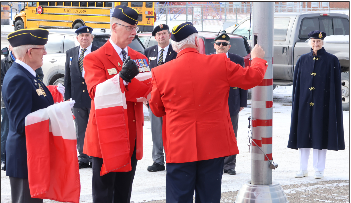
Nation Flag Day was commemorated 15 February at the Legion by changing the National flag. Branch members look on as members of the RCMP Association changed the flag and greetings were brought from local dignitaries.