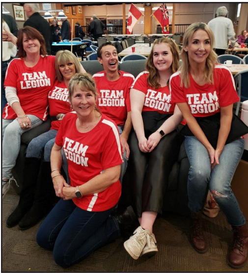
Legion staff wear their unique shirts in support of Team Legion during the Superbowl Sunday event. This was the second time being held and was well attended all while raising funds in support of veterans.

If you have any news or pictures of branch activities please submit them to the office manager. Help make the newsletter interesting for all.